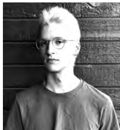
Artist snapshots Sunday 1:00pm ACU