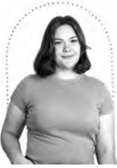
Artist snapshot Sunday 11:05am ACU