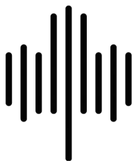
Presentation Saturday 1:30pm Monash University