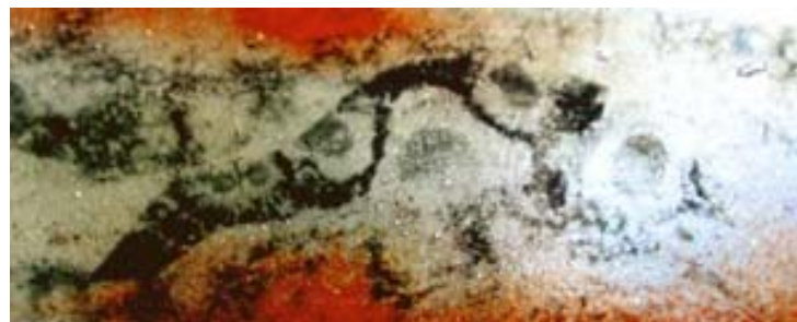
Painted Glass detail Merinda Young