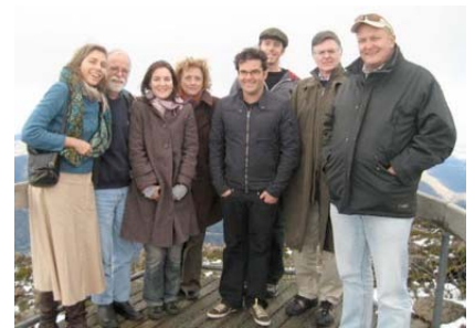
The Ausglass Board At snowy Mt Wellington